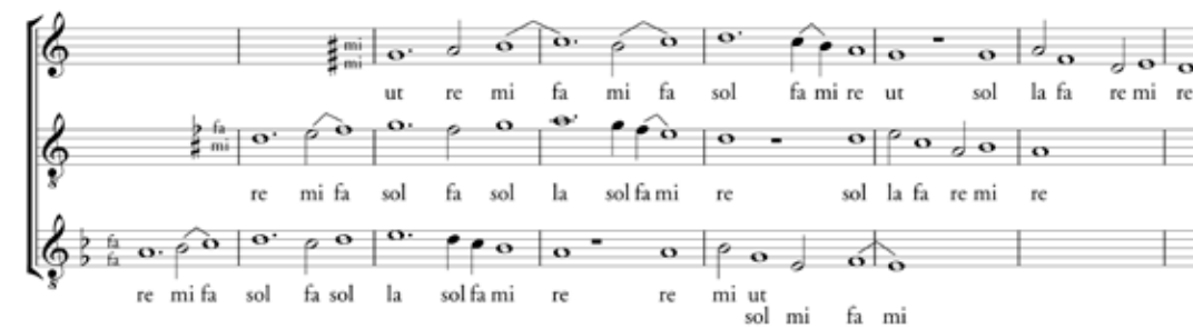
The opening of Prenez sur moi resolved into score with modern clefs and the mi-fa semitone indicated

mark the entries.) From the last notes of each part and the cadential formula they produce one can also easily deduce the harmonic interval of the canon, which is the upper fourth: that is, the second voice starts on a note a fourth above that of the first, and the third a fourth higher still.