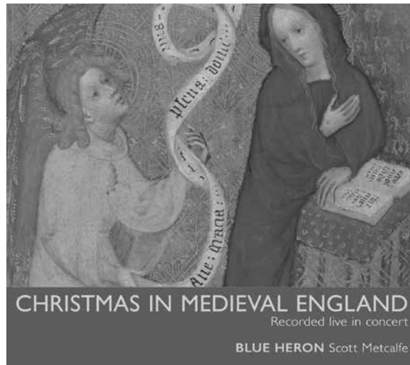
CHRISTMAS IN MEDIEVAL ENGLAND