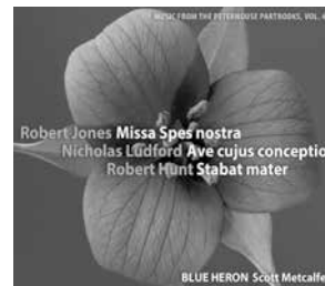
MUSIC FROM THE PETERHOUSE PARTBOOKS VOL. 3