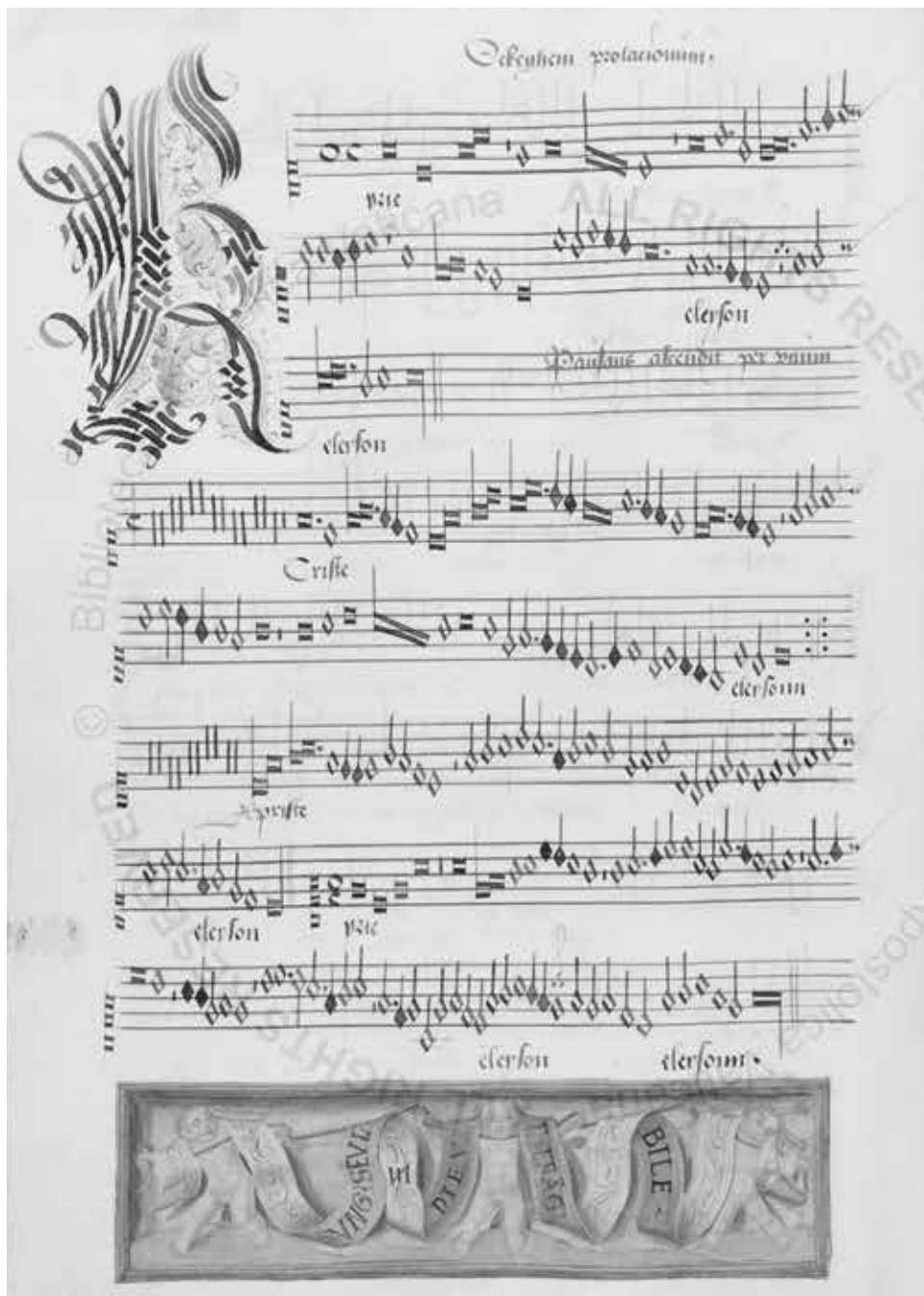
Missa Prolacionum , Kyrie, upper two parts (read from the same line under different mensurations). Biblioteca Apostolica Vaticana, MS Chigi C VIII 234, f. 98v.