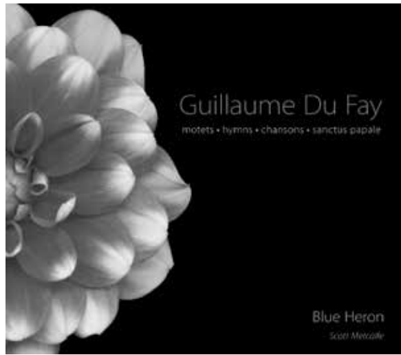
GUILLAUME DU FAY