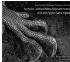
MUSIC FROM THE PETERHOUSE PARTBOOKS VOL. 2