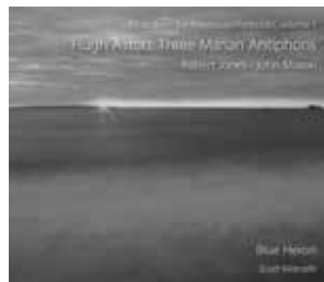
MUSIC FROM THE PETERHOUSE PARTBOOKS VOL. 1