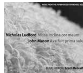
MUSIC FROM THE PETERHOUSE PARTBOOKS VOL. 4

The 5-CD boxed set The Lost Music of Canterbury: Music from the Peterhouse Partbooks is the capstone of a landmark project of international musical significance which presents extraordinary music from the last generation of medieval Catholicism in England. Judged by this music, Catholic culture remained vital and confident during this turbulent period.