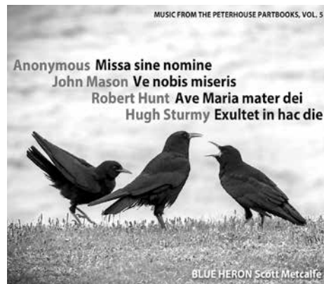
MUSIC FROM THE PETERHOUSE PARTBOOKS VOL. 5